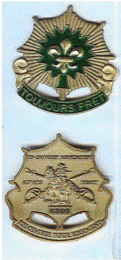
UNIT CRESTS $5.50 EACH

US ARMY BORDER OPERATIONS IN GERMANY 1945-1983 220 PAGE REPRINTED HISTORY