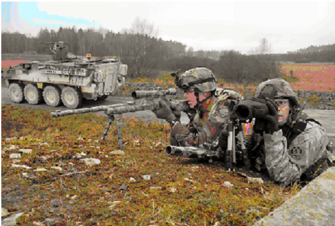
2d Squadron Sniper section training at Grafenwoehr Training Area, November 2006.