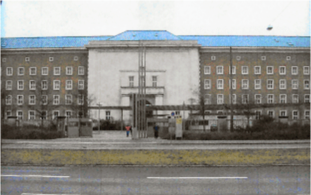
Merrell Barracks Today