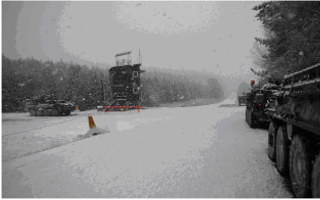
2d Squadron training at Graf during Operation Dragon Thunder, Jan 2007.