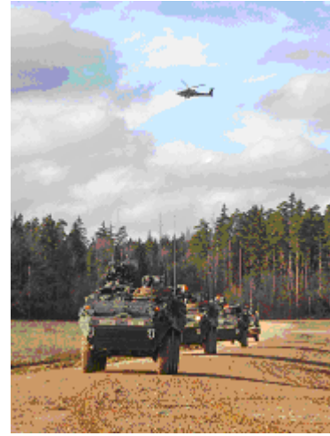
1 st Squadron Training at Hohenfels, December 2006.